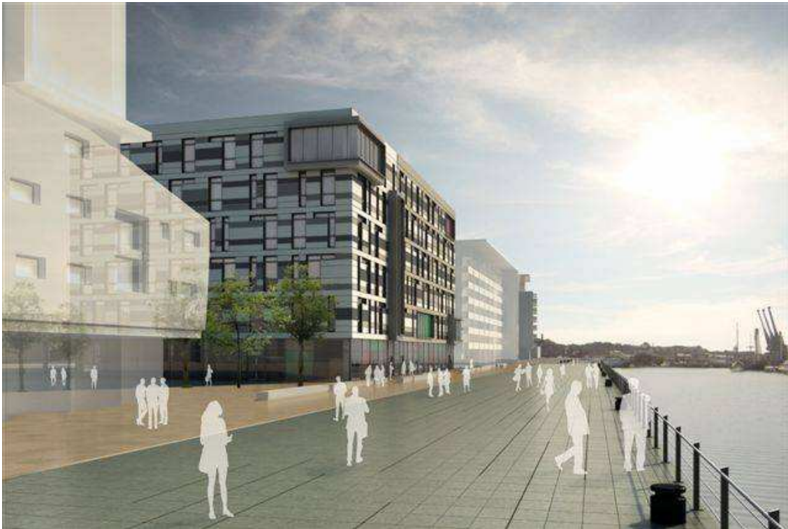
James Heir Building, University Quay – Home to the New Enterprise Hub

The physical centre for the hub will be on the top floor of the new University Campus Suffolk (UCS) James Heir building located on University Quay, Ipswich. UCS will provide the Enterprise Hub with dedicated serviced accommodation which will be able to offer facilities and support to all those participating in programmes and activities offered through the hub. It is also envisaged that over time the Enterprise Hub will work with partners around the region to create a number of local spokes which can bring enterprise support nearer to local communities, supported by a virtual network accessible to all hub participants.